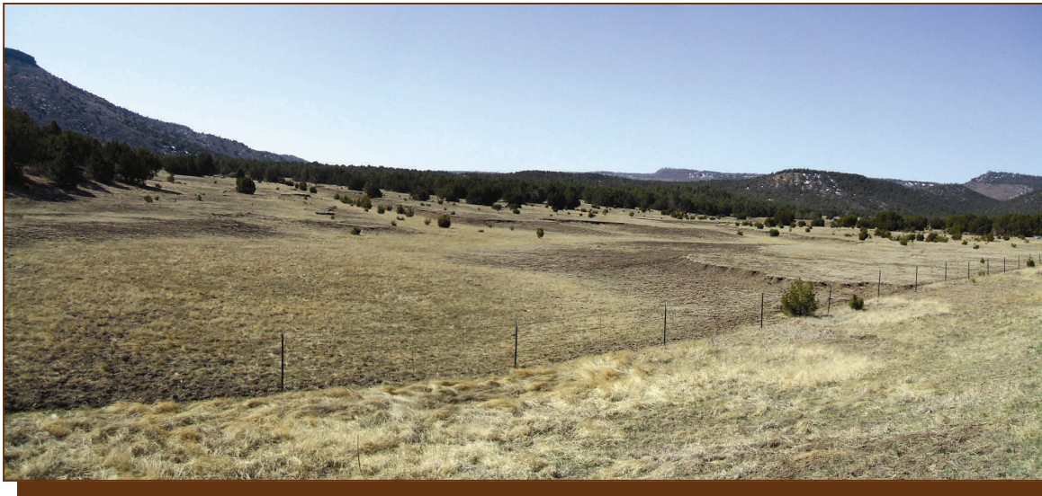
C - south to Sweetwater and Fort Union