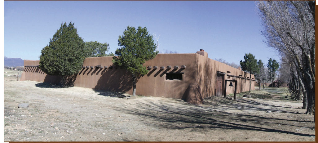
B - Carson Hacienda at Rayado