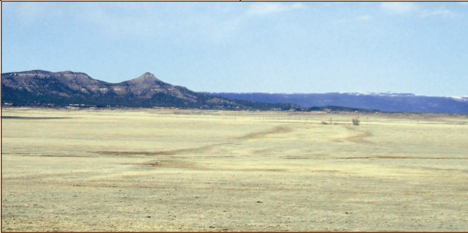
↓ F - north to Raton (formerly Willow Springs)