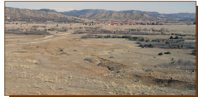
A → south to Cimarron (red roofs are the Philmont Scout Ranch)